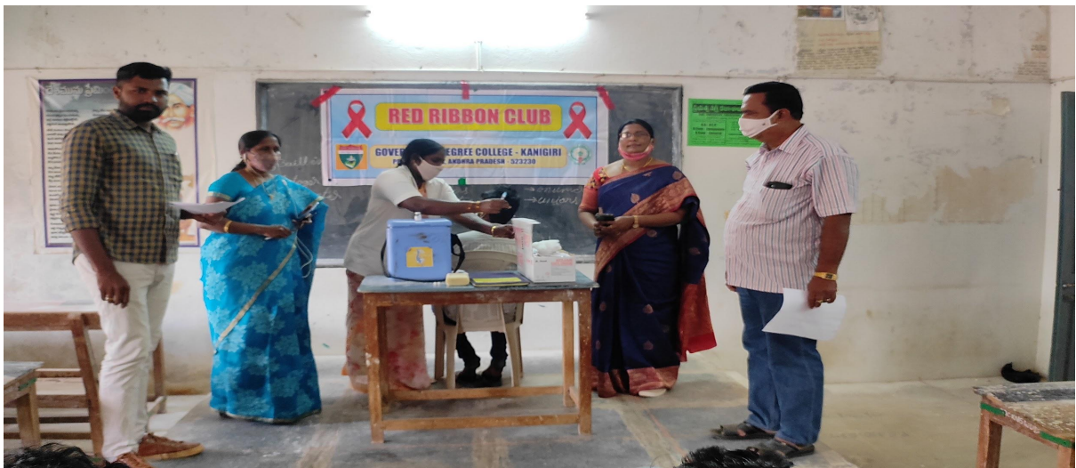
Principal and staff are supervising the vaccination drive