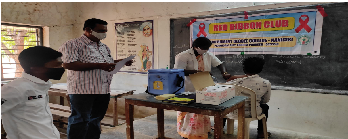
Health officials are administering vaccination shots