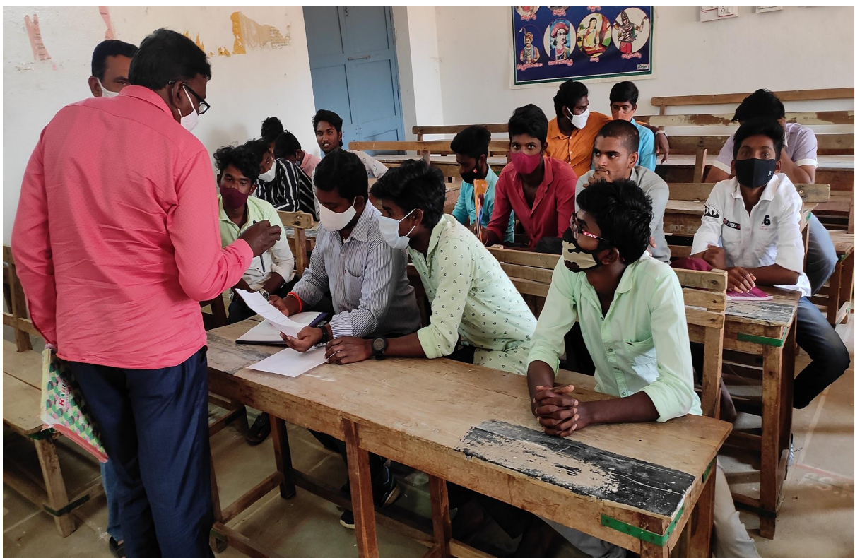
Health officials taking data from students for vaccination